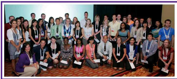
Forty-four happy $500 winners in Orlando - 2010.

The faculty judge must forward the best three essays & applications to the AOSA office by March 9, 2011 .